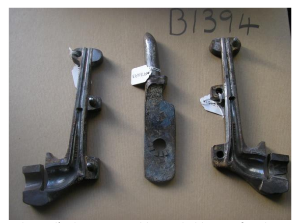
Richmond's clay pipe moulds now held in Dunfermline Museum

Moulds, of malleable iron, for producing clay pipes in a number of shapes and designs cost a guinea or more in Henry's younger days, but by the 1930s he only had six in use. The manufacture of one clay pipe was the result of eight different processes, all carried out by hand.